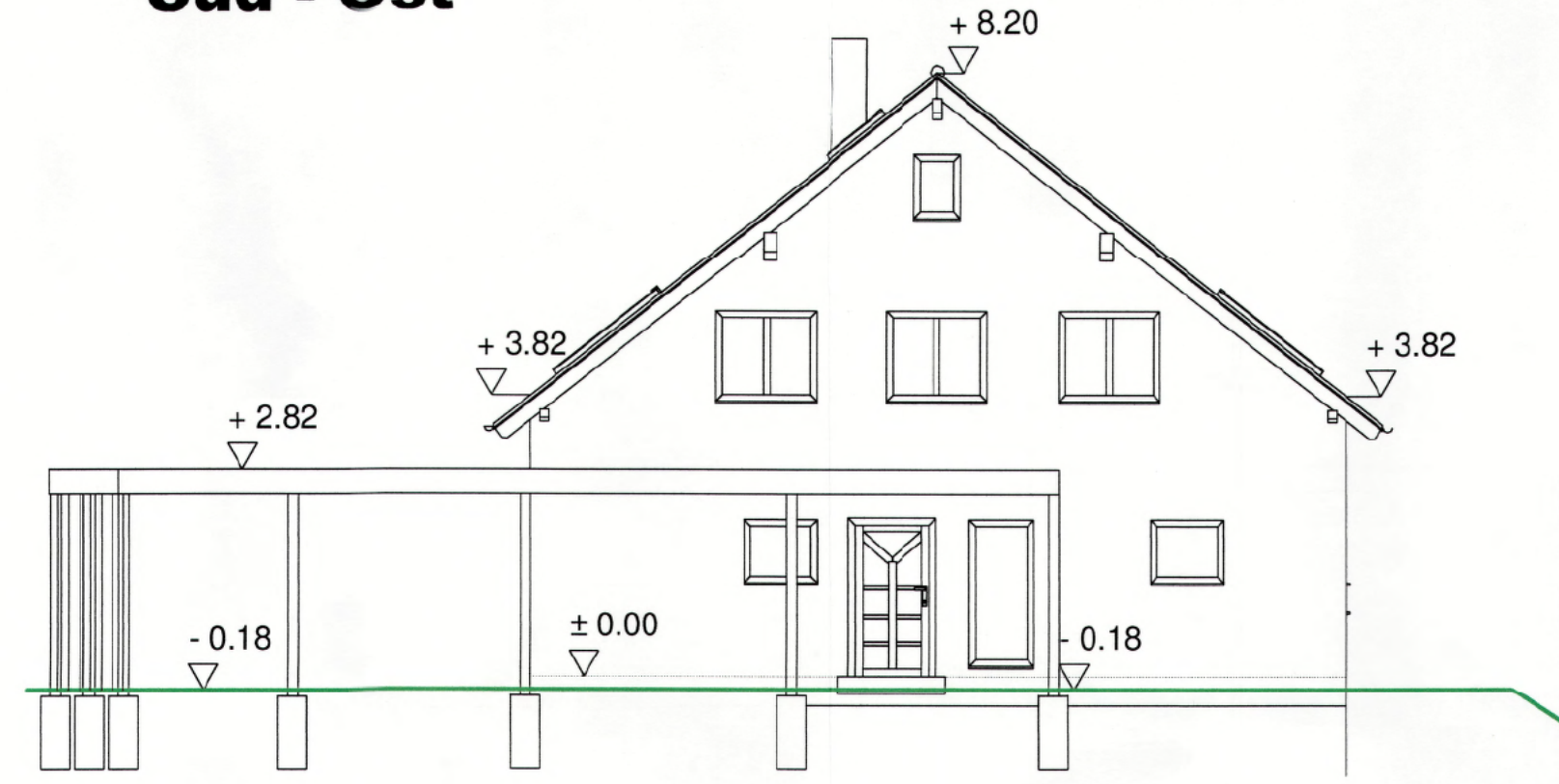
Süd - Ost