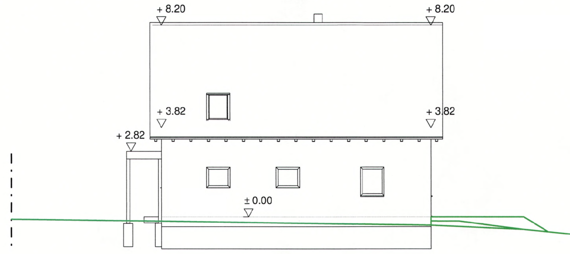
Nord - OST