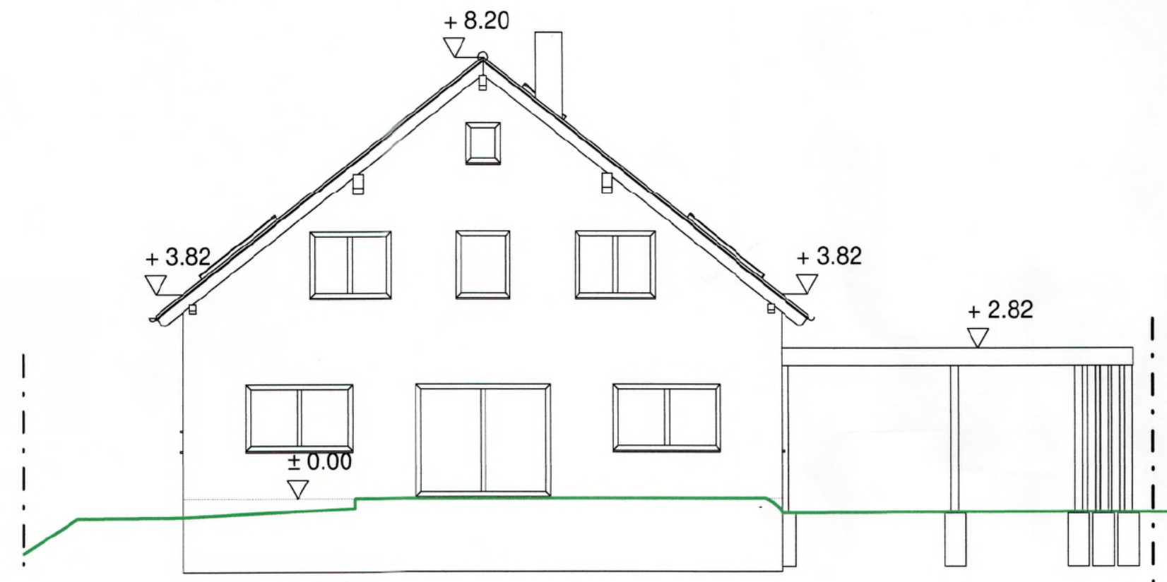
Nord - West